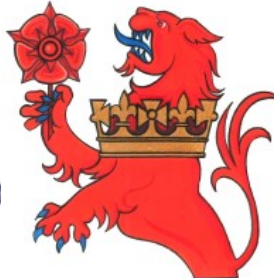
March Pursuivant 1515