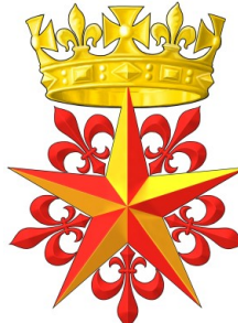
Ormond Pursuivant 1488