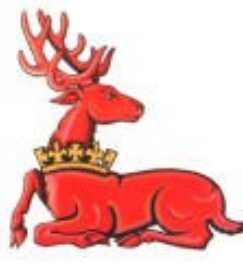
Falkland Pursuivant Extraordinary 1532