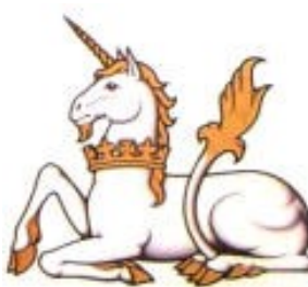
Unicorn Pursuivant 1381