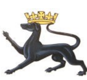
Linlithgow Pursuivant Extraordinary 1532