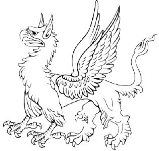
A griffin statant Or winged Argent langued and clawed Gules.