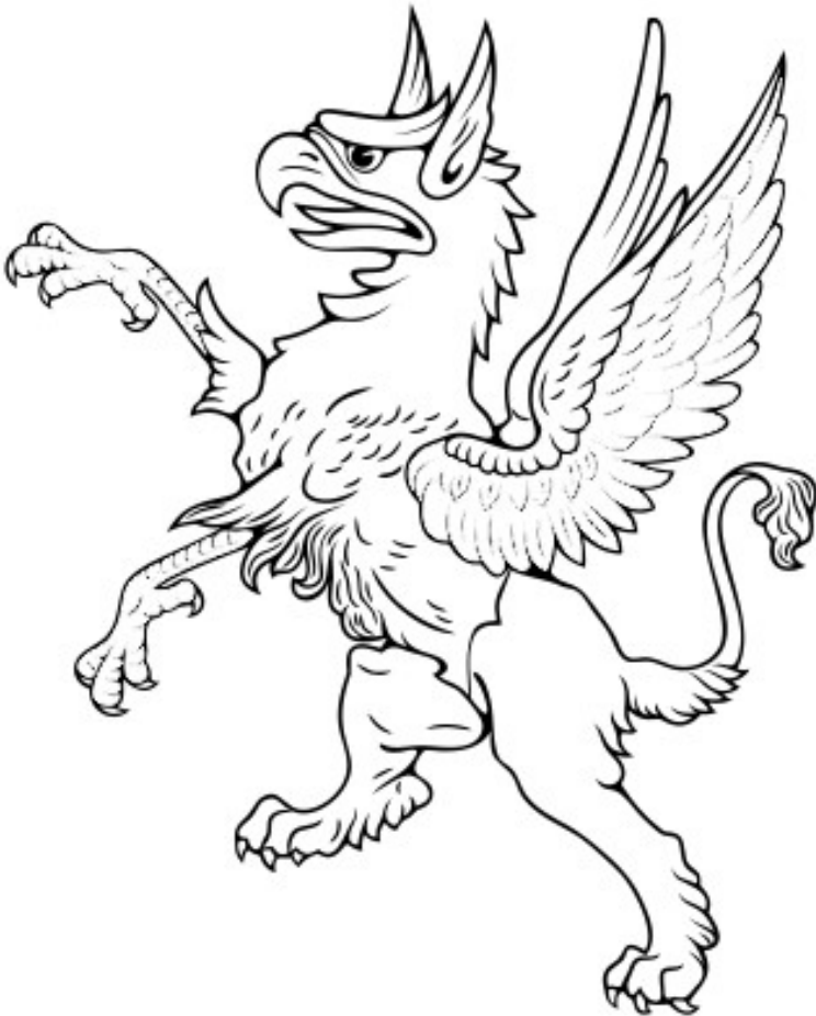
A griffin segreant Vert, langued GULES, Winged Purple, clawed Or.