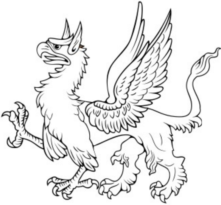
A griffin passant paly of six Gules and Or.

Can you colour in the griffins in accordance with the instructions?