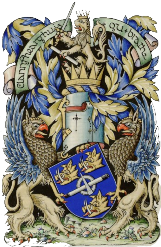
Here are two splendid gryphons supporting the ancient arms of Clannfhearguis of Strachur, matriculated in 1940 along with this standard.