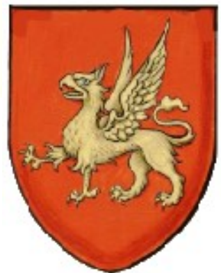
Gules a griffin passant wings elevated Or

The body of the crest is facing to the sinister, hence CONTOURNY (turned round) but the head is swivelled round hence REGARDANT .