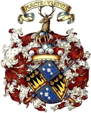
Lord Justice General

Lord Lyon King of Arms Impales his arms with his Office and Two Azure batons tipped Or in saltire: the dexter one powdered with ("semée of") thistles, rose, harps and fleurs-de-lys Or, for Lord Lyon, the sinister one semée of thistles and St Andrew's crosses Or as King of Arms of the Order of the Thistle.