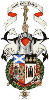
Governor of Edinburgh Castle.

A small number of people in Scotland are allowed to display their arms with the insignia of the office they hold. Sometimes, this can also involve impaling their personal arms with the arms of their office, in which case the personal arms occupy the sinister (right) hand side of the shield. Some of these offices are hereditary as we will see.