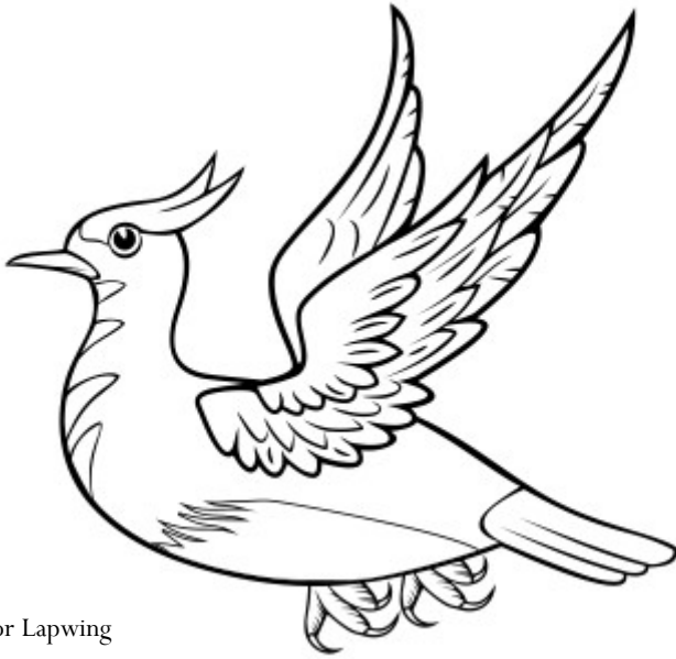
Peewit or Lapwing

In today's colouring, try to copy the colours of the real bird, if you can.